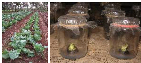
Horticulture training at Don Bosco includes a study of tissue culture techniques.

Don Bosco Agricultural School at Fuiloro fills a vital role in the training of young people in the Los Palos area which is at the eastern end of the country and quite remote from Dili. The Trust is pleased to be helping Don Bosco develop training in horticulture for young people using newer more productive techniques not common in a largely subsistence agricultural community. ✿